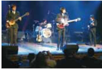
Imagine all the people...

The IHS grand finale included an exquisite banquet and a spectacular performance by When We Were Fab, a world-famous tribute to the Beatles. We took a rocking trip down memory lane and reminisced over several decades of fabulous tunes. By the end of the show the audience was on their feet and dancing to the sounds of yesteryear.