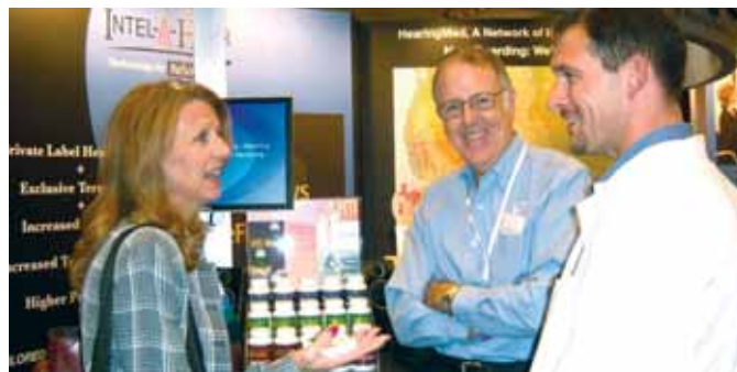
The exhibit hall was always booming with activity.

by Starkey Laboratories. It featured clinical grand rounds that included the entire IHHIS Committee.