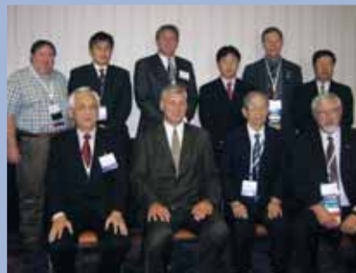
The Japan delegation met with the IHS leadership to discuss ideas for improving the regulation of the hearing healthcare industry in their country.